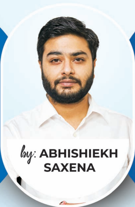
by: ABHISHIEKH SAXENA

A SOLUTION for 300+ MARKS through 50+ Hrs. of CLASSES & MENTORSHIP