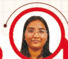
AISHWARYAM AIR-10 (CSE-2023)

“ GS SCORE helped me during the preparation I practised lot of mock test on the GS Score platform to understand the structure of answer writing. I am grateful to this platform for providing such guidance to me and many more aspirants. ”