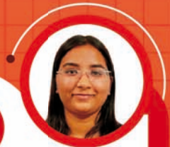
AISHWARYAM AIR-10 (CSE-2023)

“ GS SCORE helped me during the preparation I practised lot of mock test on the GS Score platform to understand the structure of answer writing. I am grateful to this platform for providing such guidance to me and many more aspirants. ”